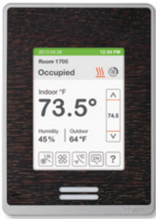
As shown: silver cover, dark brown wood fascia, and white touch screen