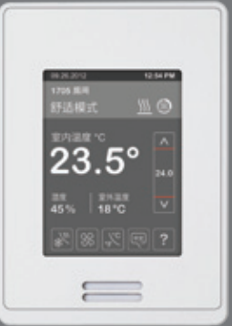
Dark grey touch screen with Chinese language