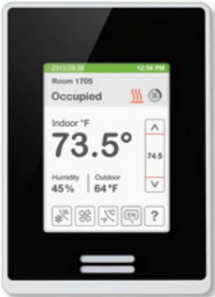
As shown: white cover, glossy translucent black fascia, and white touch screen

Save your space from monotony with our stylish room controller, adorned with a bold and glossy finish. Whether you are introducing a luxurious theme or are attracted by more eclectic decor, you will be creatively inspired by the ability to accentuate modern furnishings and styles. Our selection of bold finishes and textures will visually entice and impress your guests.