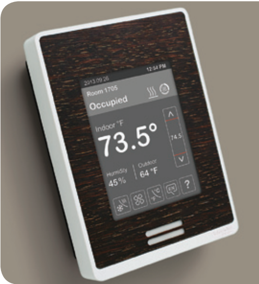
As shown: white cover, dark brown wood fascia, and dark grey touch screen

The touch screen provides the flexibility to easily customize the information being presented to your guests, such as a customizable welcome message or logo.