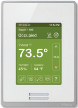
As shown: silver cover, glossy translucent white fascia, and green touch screen