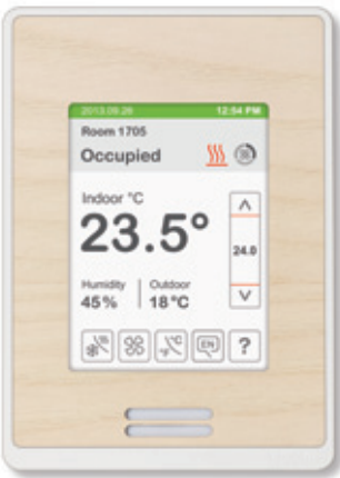
As shown: white cover, light tan wood fascia, and white touch screen

Introduce a natural ambience to any decor by bringing outdoor elements into your space. Our selection of light tan, dark brown, and black wood finish fascias offer stylish options combined with the warmth of wood. By mixing the fascia colour palettes with our customizable screen colour schemes, you can achieve the perfect variation to create your own personal statement.