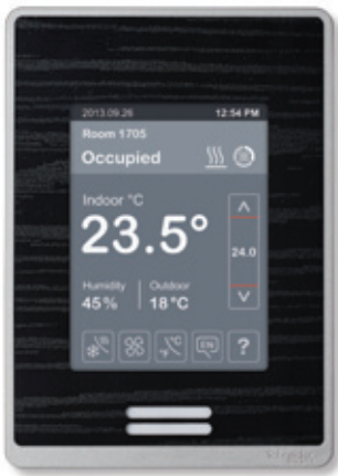
As shown: silver cover, dark black wood fascia, and grey touch screen