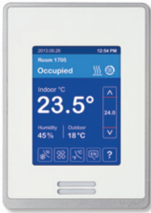
As shown: silver cover, white fascia, and blue touch screen

All these features are offered with the sole purpose of lowering installation costs, minimizing downtime, and accelerating the return on investment for building owners and facility managers.