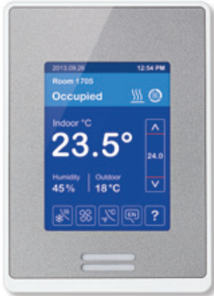
As shown: white cover, glossy translucent silver fascia, and blue touch screen