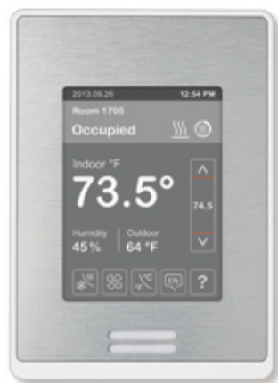
As shown: white cover, brushed aluminium fascia, and dark grey touch screen

By combining our extensive palette of colours, textures, and finishes, your personal style and creativity options are unlimited.