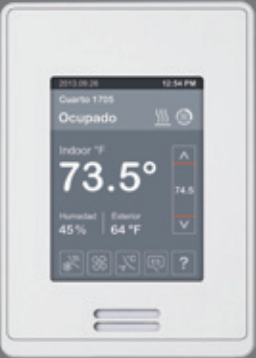
Grey touch screen with Spanish language