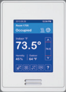
Blue touch screen with English language