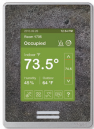
As shown: silver cover, light grey slate fascia, and green touch screen