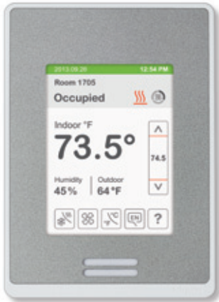
As shown: white cover, silver fascia, and white touch screen