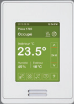
Green touch screen with French language