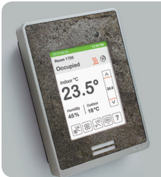
As shown: silver cover, light grey slate fascia, and white touch screen

An enjoyable customer experience begins with comfort. You no longer have to compromise comfort for energy savings. Our reliable control functions allow you to achieve both simultaneously.