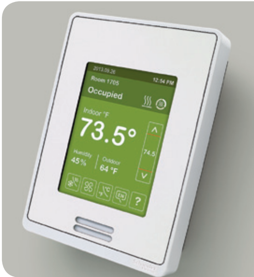
As shown: white cover, white fascia, and green touch screen

Less downtime means minimal disruption to operations, less unoccupied rooms for hotels, and uninterrupted class schedules for educational facilities.