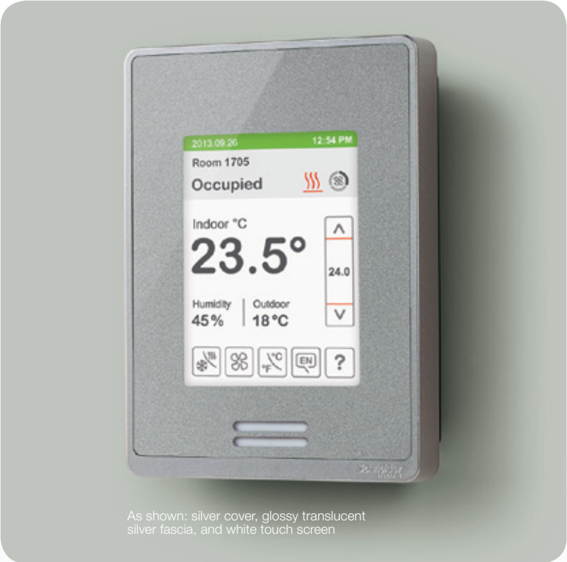
As shown: silver cover, glossy translucent silver fascia, and white touch screen

We understand that usability is important to our customers. The SE8000 Series also focuses on providing a comfortable user experience in environments where the occupant expects a bit more. The SE8000 Series' elegant design and fully customizable touch screen display allows upscale hotels, corporate offices, and high-end retail stores to offer an unforgettable user experience. Harmonizing our controller with your brand image — or the unique tastes of your guests — has never been easier.