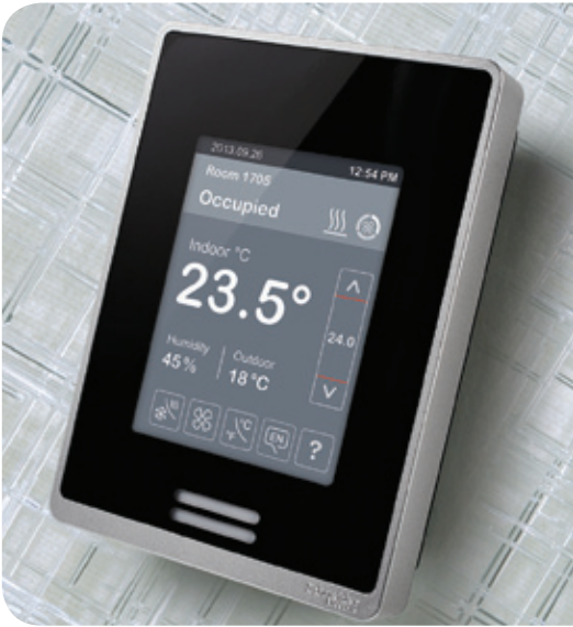
As shown: silver cover, glossy translucent black fascia, and grey touch screen

A comfortable environment fosters optimum employee performance. Fewer distractions from uncomfortable temperature variations means more productivity.