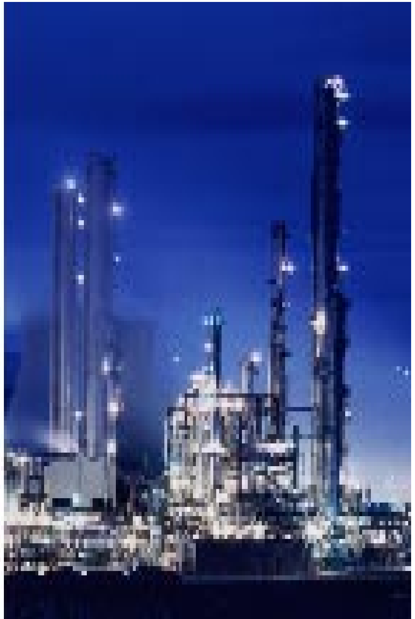
High Fault Tolerant Systems for maximum process performance.

A command register provides the user with the ability to remotely override the Hot Standby system keyswitches (run/off-line), control either Modbus port addresses, and select standby action (standby or off-line) in the event of user logic mismatch. A status register provides the user with the ability to remotely monitor each controller's status (primary, standby or off-line) and also monitor logic mismatch status. A non-transfer area (table of registers) which are not sent to the standby unit every scan can be defined to reduce scan impact and allow for internal diagnostic routines to be performed in the standby unit. Two reverse transfer registers are also provided to send data from the standby unit to the primary unit.