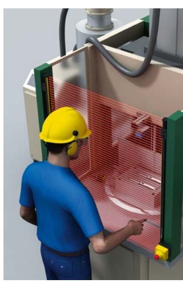
Fast response time allows for fast cycle times.