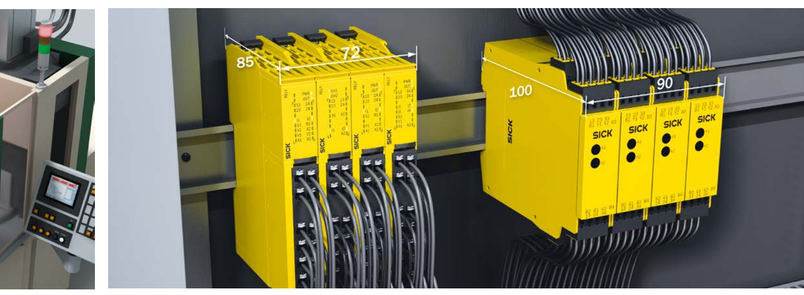
A housing width of just 18 mm dramatically reduces the amount of space required in your control cabinet.

With just a single wiring plan for each module, you can find the right terminal right away. The wiring is carried out at the front of the module so it is easily accessible.