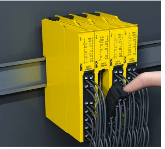
One-click removal of terminals.

ReLy delivers the entire range of applications and functionality in a single compact housing. So these four aces beat the full house in your control cabinet.